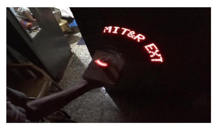
Fig - 3: Final assembly of mounting piece and POV Display