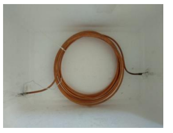
Fig (3):- Copper Tube