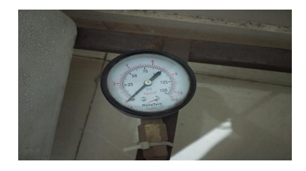
Fig (4) :- Pressure Gauge