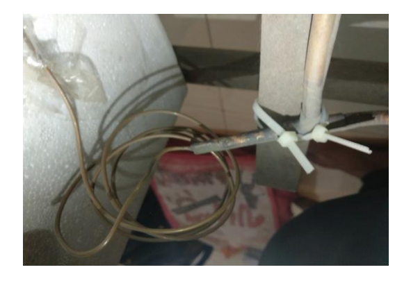
Fig (5):-Capillary Tube

we use capillary as thermal expansion vale in which the we get the refrigerant effect with the help of thermal expansion vale. In which we control the pressure LPG