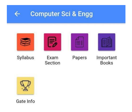
Application: List of Modules

Above page shows the registration page of application where the users can register by entering their name, valid email address, mobile number and password.