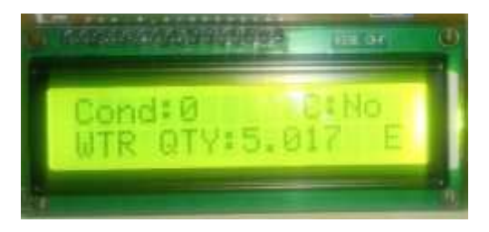
Fig.3 Display water measurement in LCD

When water flow through the sensor, it rotates and generates pulsated output after each cycle. This pulse is browse by microcontroller and it sends command consequently. Number of pulses over specified time interval is compared with standard (2.25 ml/pulse).