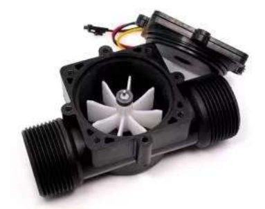
Fig.2 Flow rate sensor

The Arduino flow meter works on the principle of the Hall result. Here, the Hall Effect is utilized in the flow meter using a small fan shaped rotor, which is placed in the path of the liquid flowing. Thus a voltage/pulse is evoked as this rotor rotates. In this flow meter, for every liter of liquid passing through it per minute, it outputs about 4.5 pulses. We live the amount of pulses employing an Arduino and so calculate the flow in liters per hour (L/hr) exploitation a straight forward simple conversion formula.