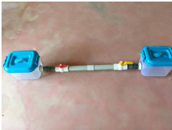
Fig 2: Diffusion mould