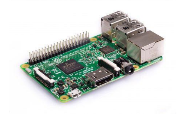
Fig -2: Raspberry Pi Model B+

Raspberry Pi is an ARM based credit card sized SBC (Single Board Computer) developed by Raspberry Pi Foundation. It plugs into a computer monitor or TV, and uses a standard keyboard and mouse. It runs Debian based GNU/Linux OS (Operating System).