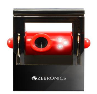
Fig -3: USB Camera

Webcam is a video camera that feeds or streams its image in real time to or through a computer to a computer network. When "captured" by the computer, the video stream may be saved, viewed or sent on to other networks travelling through systems such as the internet, and e-mailed as an attachment.