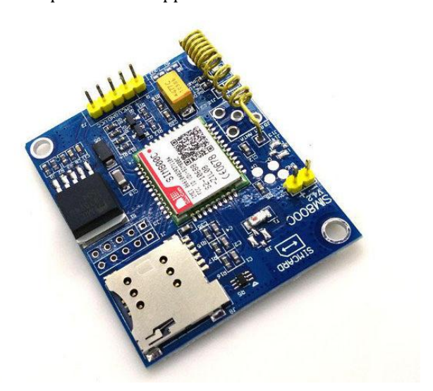
Fig -4: SIM 800C

This GSM Modem can accept any GSM network act as SIM card and just like a mobile phone with its own unique phone number. Advantage of using this modem will be that you can use its RS232 port to communicate and develop embedded applications.