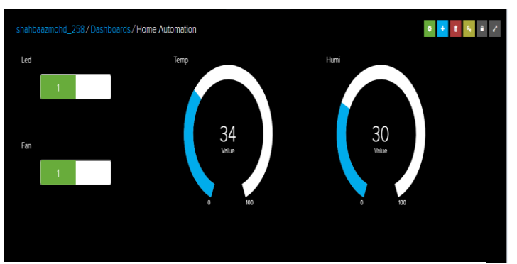
Fig 4: Adafruit Dashboard

After the successful connection to the server, the data of sensor are stored in the cloud for monitoring. The above figure allows us to monitor and control the system. From this Dashboard Toggle Buttons are used to control the home appliances.