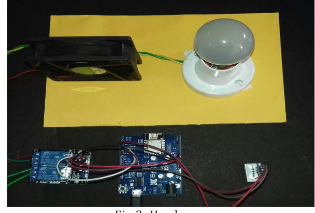
Fig 3: Hardware