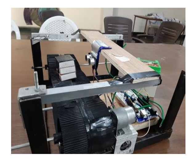
Fig-3: Construction (Angle 2).