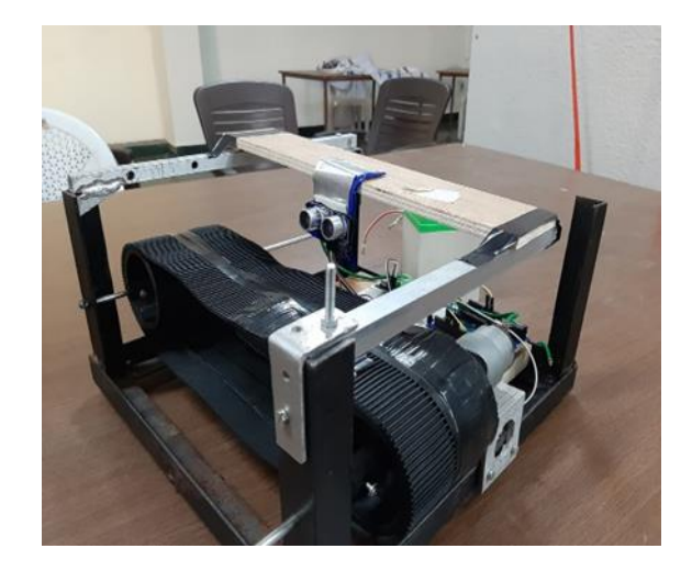
Fig-2: Construction (Angle 1).