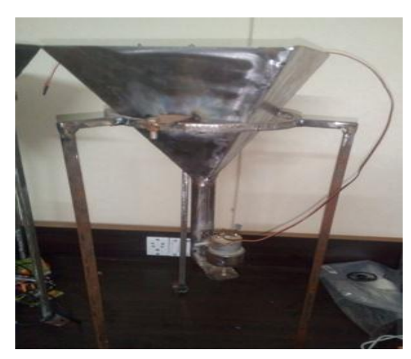
Fig2: Hardware System

The password is operated according to the programming done in the ARM 7 controller. The authentication is done for the hardware section through (online) web page. The web page has an access of unique OTP and user login. The GSM module is interfaced with the controller for giving an OTP to the card holder. It consists of individual security modules for accessing the online login system.