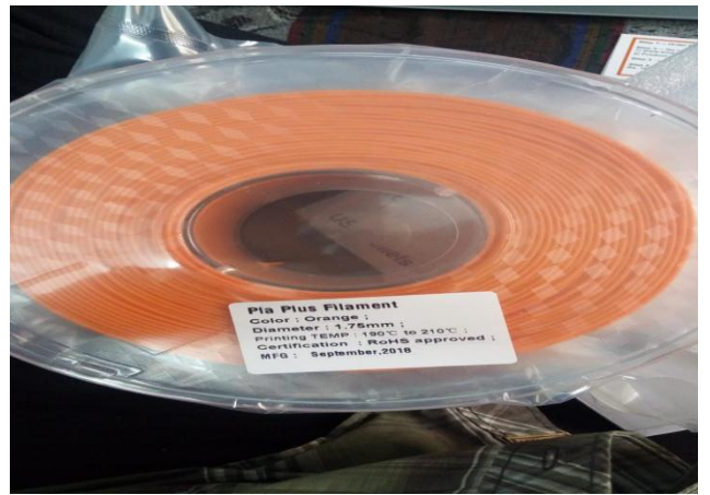
Figure 1: PLA Material

Polylactic Acid(PLA) (is derived from corn and is biodegradable) is another well-spread material among 3D printing enthusiasts. It is a biodegradable thermoplastic that is derived from renewable resources. PLA glass transition temperature is between 60 - 65 \degree C , so PLA together with ABS could be some good options for any of your projects. [3]