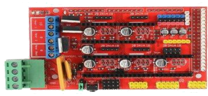
Figure 3: RAMPS 1.4 Control Board