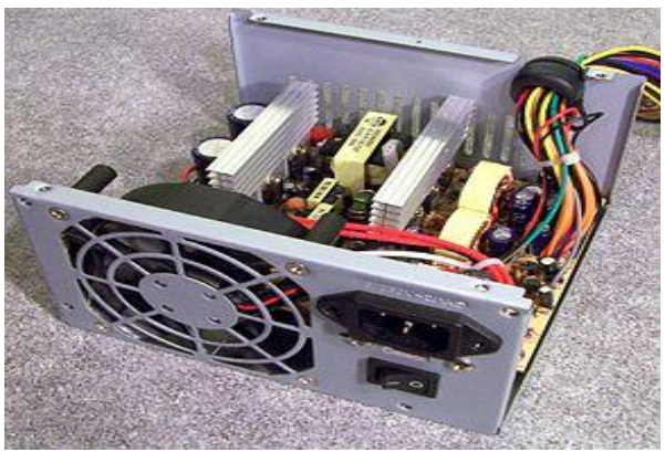
Figure 2: power supply unit

A 3D printer requires electricity in order to operate its motors, control boards, and heating elements. The most readily available source of electricity is a standard wall outlet. However, the 110-120V AC power cannot directly power the 3D printer. The components require lower-voltage DC power to operate, and would quickly burn out from the high voltage from the outlet. Therefore, a power supply unit (PSU) is necessary to convert the 110-120V AC to DC voltage, typically 12-24 V, which can be used to power the printer. There are two main designs for a PSU circuit: linear power supply or switch-mode power supply. [5]. Most power supplies that are applicable for use in a 3D printer are switch-mode power supplies.