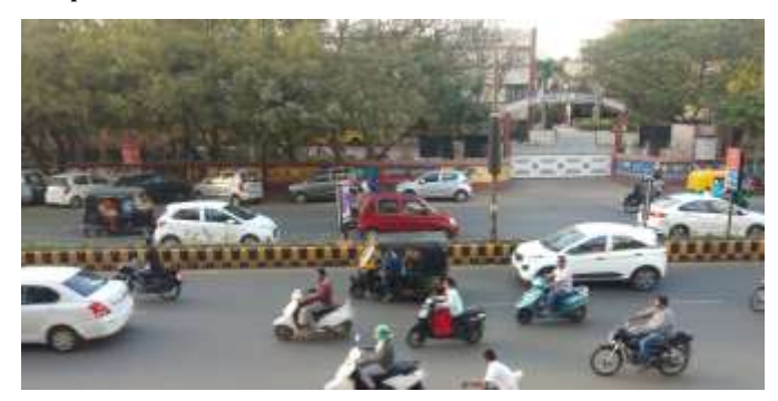
Fig -2 View of Kotecha to KKV circle

Rajkot is the 4<sup>th</sup> largest city in the Gujarat and 35<sup>th</sup> largest city in India with population more than 1.2 million as per survey in 2015. It is also 147^{th} fastest growing city in the world. It is the capital of Saurashtra region. It is located at 22.3° N and 70.78^{\circ} E and is spread in the area of 170.00 \, \text{km}^2 and located 138m above mean sea level. Climatic condition of Rajkot is generally semi-arid and average low temperature lies between 20^{\circ}\text{C} to 22^{\circ}\text{C} and average high temperature is 40^{\circ}\text{C}