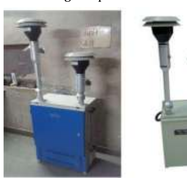
Fig- 4 Combo Sampler

Ambient Air Monitoring is used to measure different pollutants such as SO_{2} , NO_{X} PM_{2.5} , P.M_{10} which is the major factor from vehicles. For measurement of these pollutants one of the following samplers are used.