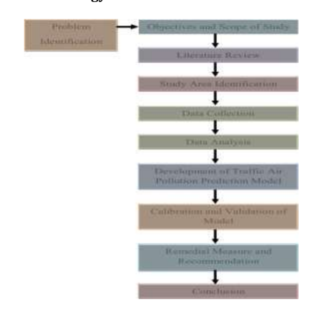
Fig -1: Flow chart of Methodology