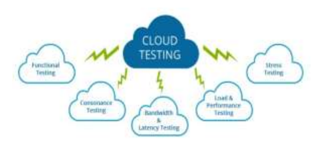
Fig. 3: Cloud-based testing

Volume: 06 Issue: 04 | Apr 2019 www.irjet.net p-ISSN: 2395-0072