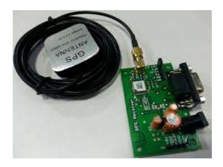
Fig -5: GPS Module

The Global Positioning System (GPS) is a space based satellite navigation system that provides location and time information in all weather conditions, anywhere on or near the earth where there is an unobstructed line of sight to four or more GPS satellites. The system provides critical capabilities to military, civil and commercial users around the world. It is maintained by the United States government and is freely accessible to anyone to anyone with a GPS receiver.