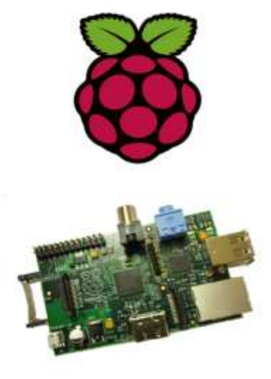
Fig -1: Raspberry pi

In this project Raspberry Pi 3 is used. Some of the other devices are connected to it. It is installed in our PC. The other devices connected to the raspberry pi are gas sensor, ultrasonic sensor, IR sensor and GPS. All the sensor's values are sent to the raspberry pi and it decides whether to send mail to the municipality or not. Thus the raspberry pi plays the role of brain in a human body in the embedded applications.