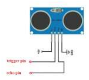
Fig -2: Ultrasonic sensor

International Research Journal of Engineering and Technology (IRJET)e-ISSN: 2395-0056Volume: 06 Issue: 04 | Apr 2019www.irjet.netp-ISSN: 2395-0072