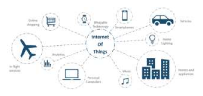
Fig -6: Internet of things

The term "Things" in the Internet of Things refers to anything and everything in day to day life which is accessed or connected through the internet.