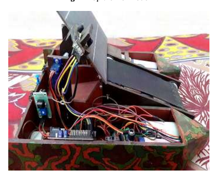
Fig-5: Side View of Model