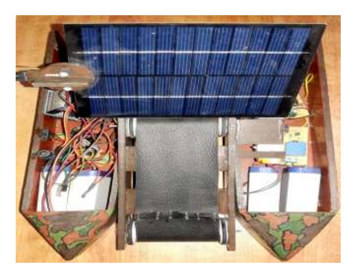
Fig -4: Top View of Model