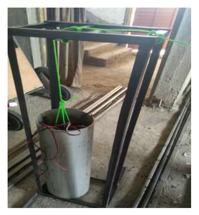
Fig. (2) Actual setup