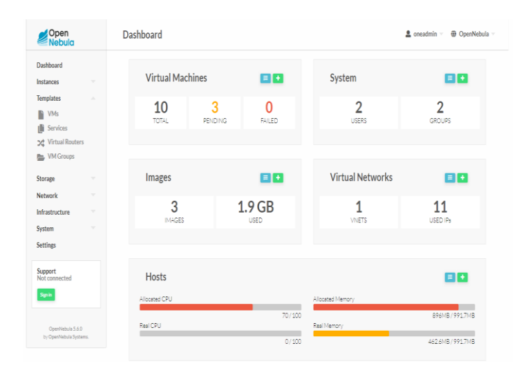
Fig-1: Open nebula sunstone (Identity service)

The identity service of Open nebula i.e. Open nebula sunstone shows dashboard for open nebula cloud system. This shows status of all the components which are running on open nebula cloud system platform. It shows the number of running instances, pending instances and number of failed instances. It also shows information about images, virtual networks, system and hosts. This is shown in the following screenshot: