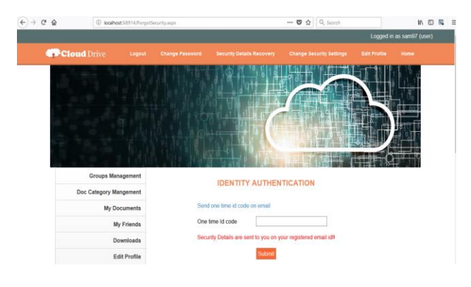
Screenshot 2: User authentication

While authenticating to users identity the system can send the OTP through mail to user. That OTP will be placed by user into system and by this system will authenticate user.