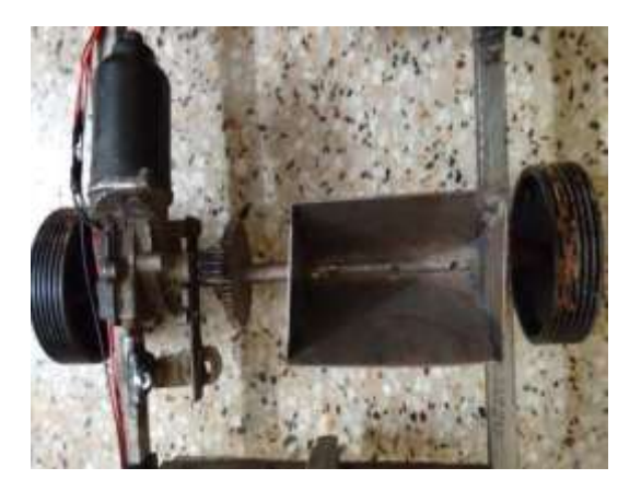
Fig-5: Seed sowing operation