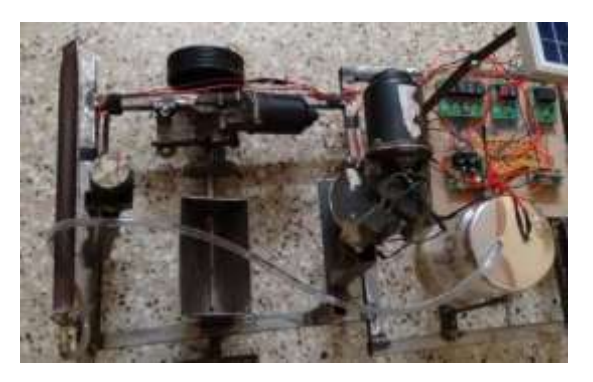
Fig-7: Water spraying Opertion