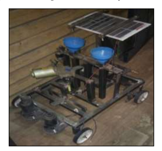
Fig-1: Multipurpose agricultural robot

leveling, water spraying.[3] These functions can be integrated into a single vehicle and then performed.