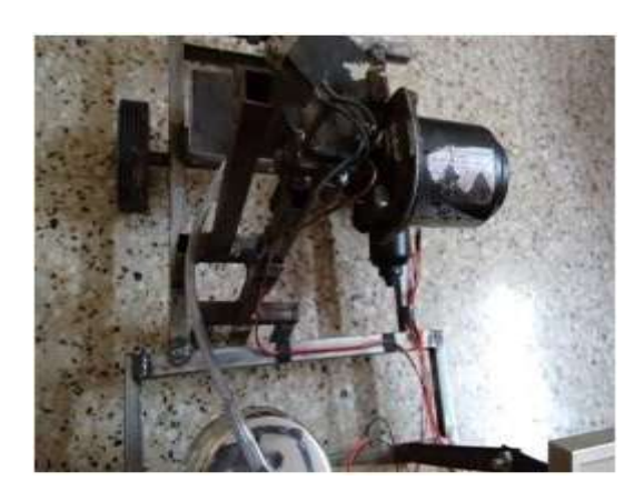
Fig-4: Cultivating opertion