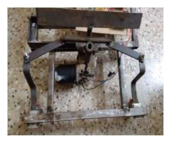
Fig-3: Steering Operation