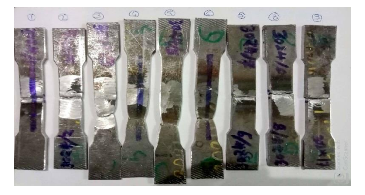
Fig-1:- Specimens after Tensile Test.