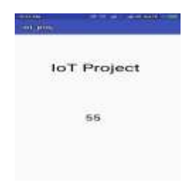
Fig 4: Rabbitmq output in android phone

As the message gets published in the queue from an android program, it is shown in the android application as shown in figure 4. As and when the new value gets stored, values in the android application get updated too.