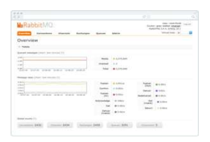
Fig 2: Home page of RabbitMQ server

First you need to install RabbitMQ server. By default it is available in the API localhost. In your web browser you need to type http:localhost:15672. You will be redirected to rabbitMQ server login page. By default, the username and password are set to guest. We can change it if we desire to do SO.