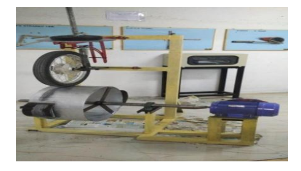
Figure 2&3. Actual Experimental Setup and Experimental Setup (CAD Model)