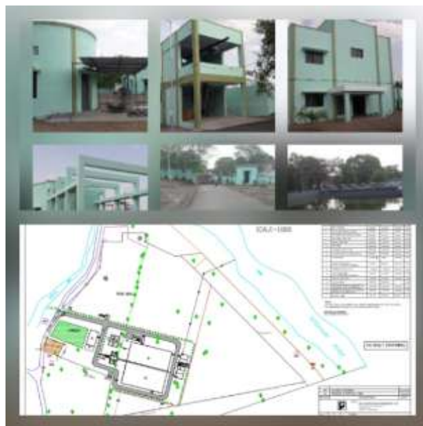
Table 1 – Analysis of data collected from Project 1

Project 1: Name of project: Design, Construction, Supply, Erection, Testing, Commissioning, Start-up and Performance run of 3 month followed up by 0 & 60 months for following works on lump sum turnkey basis at Gangapur in Nashik City under AMRUT programme