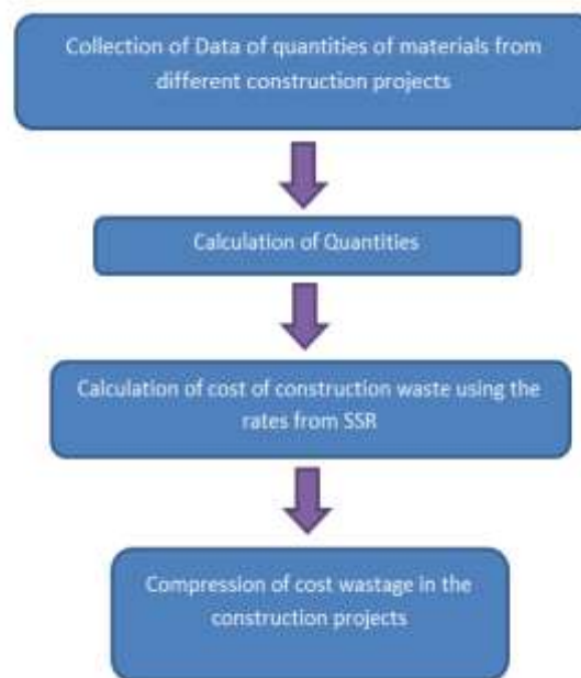
Fig.3. Flowchart of Methodology for Case Study