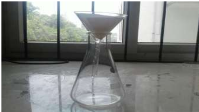
Fig-1: Experimental setup for filterable and non-filterable solid