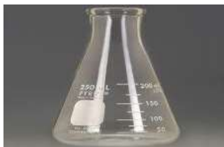
Fig -2: Batch Reactor

A batch reactor is a vessel used to mix chemicals under tightly controlled conditions. It is distinguished from a continuous reactor by its cyclic use, mixing one batch at a time, as opposed to the constant reaction carried out in a continuous reactor. In this project Batch hydrogen production experiments are carried out in a 250-ml Erlenmeyer flask which acted as batch reactor. The flask was tightly closed using a rubber cork with two outlets, one for sample collection and the other for hydrogen gas. The sample collection outlet was tightly closed using a clamp in order to prevent the entry of air from outside. The active working volume of the batch reactor was 100 ml.