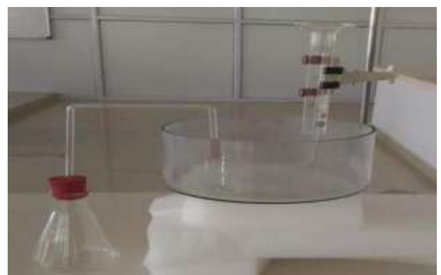
Fig-4: Adopted Experimental Setup