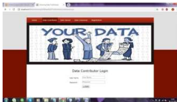
Fig 3: Data Contributor Login