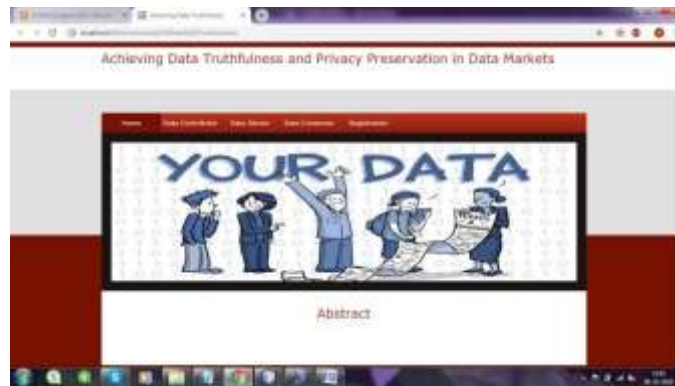
Fig 2: Home Page