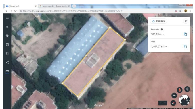
Fig -2: GOOGLE MAP Practical Out-put by using a software