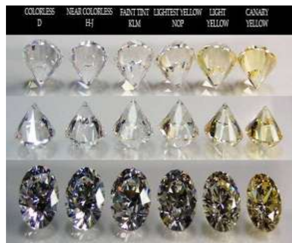
Fig 1- Diamond color grading

labouring for 60 minutes, the graders eyes regularly progress toward becoming extremely worn out, and wronged value acting can be made effortlessly. Therefore to develop an in tag rated auto-measuring system for diamond grading is becoming a challenging research topic. Proposed system works on diamond quality grading based on colors of diamond, texture of a diamond and clarity. In order to get accurate diamond images, a special hardware source is employed. Quality assessment done through three important feature extraction of the diamond like color, texture and clarity. Then extracted features are passed to the classifier for grading. On the basis of grading quality of a diamond will be determine.