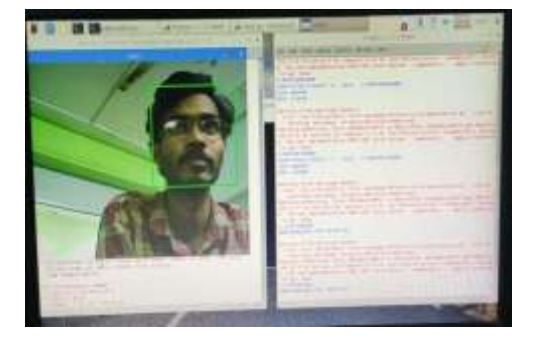
Fig 7: Face Not Detected image