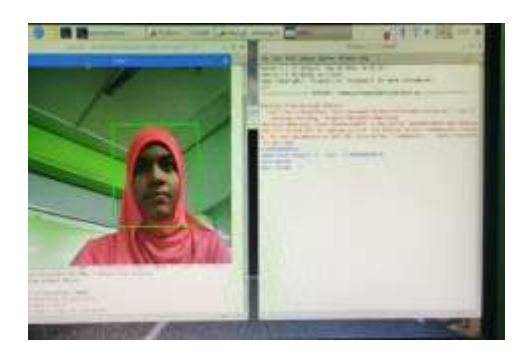
Fig 6: Face Detected image