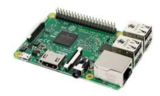
Fig 1: Raspberry Pi

Raspberry pi3 is dependent on a Broadcom BCM2835 system on a chip (SoC). It incorporates an ARM1176JZF-S 700 MHz processor.