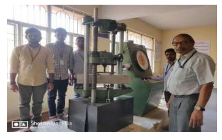
Figure 1: Photograph of Flexural Test Set Up