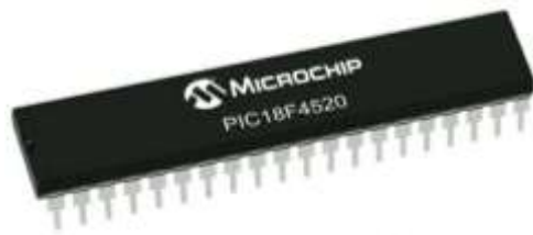
Fig 1: PIC Microcontroller