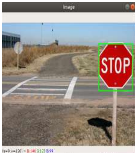
Fig -4: Stop Sign detection