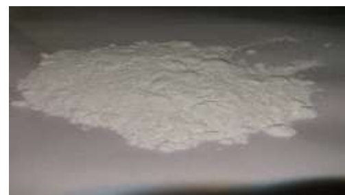
Fig -1: Sample Zinc Oxide

ZnO added to the system Portland cement water changes the kinetics of the hydration process substantially. Amorphous zinc hydroxide is formed and inhibits the reaction of tricalcium silicate with water, resulting in an induction period prolongation. This effect depends on the amount of ZnO added to the hydrated paste. The transformation of zinc hydroxide into calcium hydrozincate provokes the further hydration.