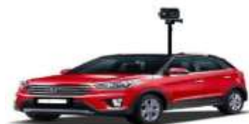
Fig 6:-Ultramodern car