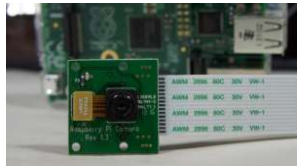
Fig 4:- Raspberry Pi Camera Module