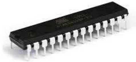
Fig 2:- ATmega(328P)

2592x1944 and video resolutions of 1080p30, 720p60 and 640x480p60/90, here we have used 16MP camera.