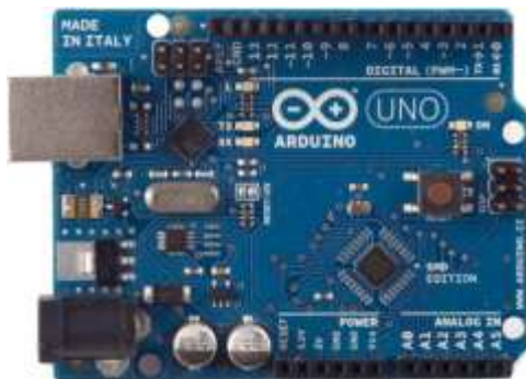
Fig 3:- Arduino Uno