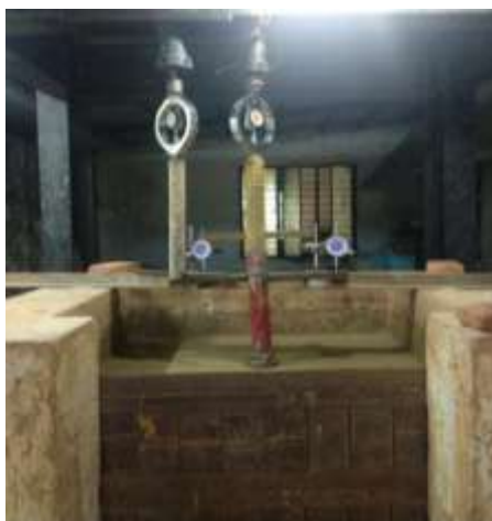
Fig -3 Experimental Setup

The diameter and depth of circular footing are 'B' and 'D' respectively. Diameter of the footing is 100 mm. Depth to diameter ratio (D/B) is taken as 0.5. Distance between two dial gauges is fixed as 350 mm. Vertical load (P1) is taken as 90 N. Eccentric load (P2) is increased at regular intervals. The eccentric distance of eccentric load P2 is fixed as e = 245 mm. The experimental setup is shown in the Figure 3.