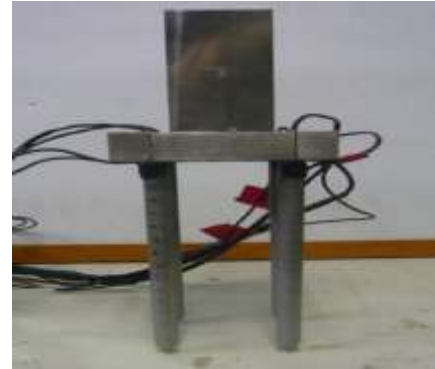
Fig -2 Pile raft model

displacement of the foundation due to the horizontal loads affects the vertical resistances of piles, which results in the different mobilization of moment resistances between the piled raft and pile group foundations.