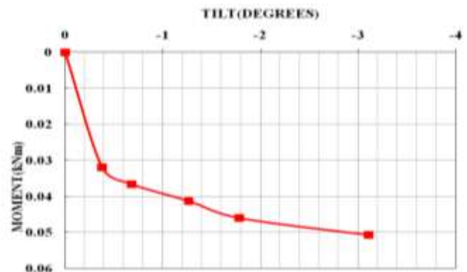
Chart -1: Moment versus rotation curve

Moment versus rotation curve for vertical load P_1=90 N and D/B=0.5 is presented in Chart 1.