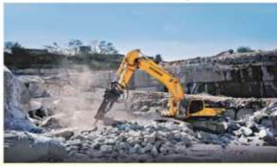
Fig 2. Mining of aggregates