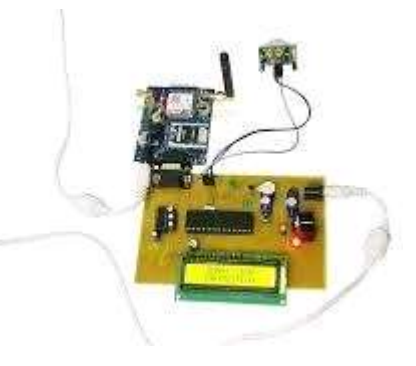
Fig 4 EXPERIMENTATION WORK

With continuous status of crops in field, appropriate arrangements can be made in ad-vance to avoid any loss/emergency. This model has LCD display to display flame intensity. This device is quite economical with most economical cost. Apart from that, this device can be used in industries, hospitals, homes, sites etc to detectfire.