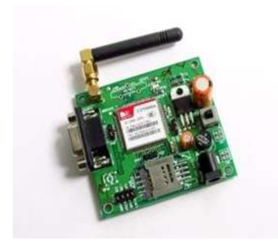
Fig 3.3 GSM MODULE

GSM stands for Global System for Mobile Communications. It is a standard set devel- oped by the European Telecommunications Standards Institute (ETSI) to describe pro- tocols for second generation (2G) digital cellular networks used by mobile phone . A Modem is a device which modulates and demodulates signals as required to meet the communication requirements. It modulates an analog carrier signal to encode digital information, and also demodulate such a carrier signal to decode the transmitted information.