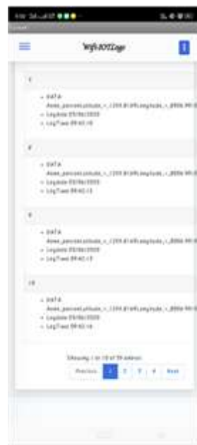
Figure 3.ITS Android App Figure 4.Output of ITS App