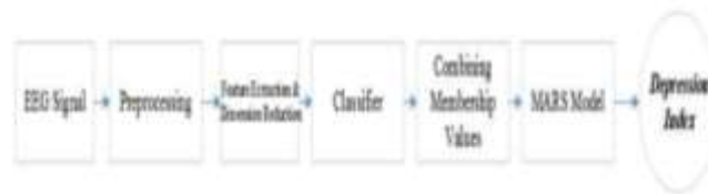
Fig 1: Existing system Block Diagram

Vector Machine(SVM). Using the algorithm expected results of numerical index for depression were obtained. The results were obtained with a percent relative difference(PRD) of 5% and a Pearson correlation of about 0.92. The results of the experiments reveals that the estimated numerical value of the designed system is of high correlation and low amount of PRD compared with the first beck number, associated with everyone. In this system, a unique algorithm is proposed to estimate the numerical index of the severity of depression. For this purpose, different linear and nonlinear methods employed to extract the features from EEG signals. Moreover, dimension reduction methods were utilized to preserve the generalization ability of classifier. a complete number of 75 subjects were employed in this research, and BDI of each subjects was at hand, and that they were categorized to 4 levels of depression. Since there are 19 channels for every subject, the Dempster-Shafer method was accustomed combine the data of various channels.