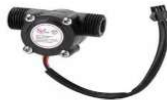
Figure 3: Hall Effect Sensor [6]

2) Hall Effect Water Flow Sensor [6]: This sensor sits in line with your water line and contains a pinwheel sensor to measure how much liquid has moved through it. The sensor comes with three wires: red, black and yellow.