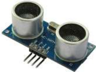
Figure 6: Ultrasonic Sensor [8]

5) Ultrasonic Sensor [8]: Ultrasonic sensors are reliable, cost-effective instruments for these applications. It transmits a sound pulse that reflects from the surface of water and measures the time taken for the echo to return to determine the distance from the water.