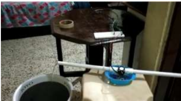
Figure 7: Hardware Input