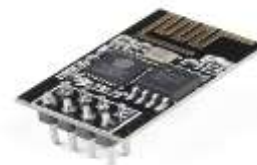
Figure 4: Wi-Fi Module [9]

3) Wi-Fi Module [9]: The Wi-Fi module used in this project is ESP8266. It follows TCP/IP stack and is of low cost. This microchip allows the microcontroller to connect to a Wi-Fi network. ESP8266 has 1MB of built-in flash, single chip devices able to connect Wi-Fi.