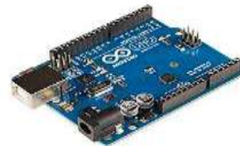
Figure 2: Arduino UNO [5]

1) Arduino UNO [5]: Arduino UNO is an open-source microcontroller board based on the ATmega328P and was developed by Arduino.cc. It has a set of digital and analog input/output pins.