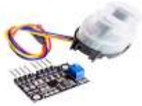
Figure 5: Turbidity Sensor [7]

5) Ultrasonic Sensor [8]: Ultrasonic sensors are reliable, cost-effective instruments for these applications. It transmits a sound pulse that reflects from the surface of water and measures the time taken for the echo to return to determine the distance from the water.