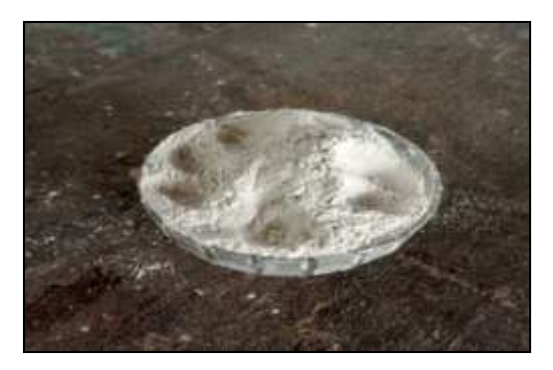
Fig -2: Ceramic powder

The ceramic powder can be collected from ceramic waste at ceramic industry which is located at Trichy district. Basically, Ceramic is an inorganic and non-metallic material which are prepared by heating the particles and they can withstand high temperatures. They are obtained from the heat treatment of various hydrated crystalline and dry amorphous particles which changes the structure of the powder and its composition. After heating, the natural cooling is done at the rate of 10°C per min ute.