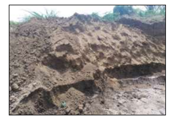
Fig -1: Clay material

kiln, they are non-plastic. Generally, clay is available in various colors from white to dull grey and brown to deep orangered.