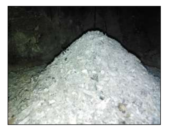
Fig -4: Wood ash

The wood ash is obtained from the burning process of pulp, wood, paper mills and other thermal power generation plants. They are the renewable sources of energy and an environmentally friendly material. The wood ash is used in the gardens because it has a good potash source. The main constituent of wood ash is calcium carbonate and they are alkaline in nature. The amount of wood ash obtained depend upon the type of wood burnt.