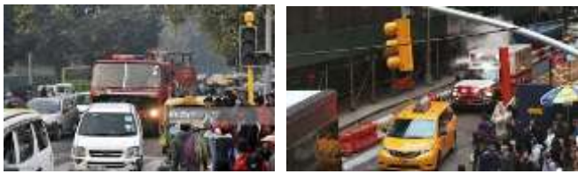
Figure 1: Emergency vehicles struck in traffic