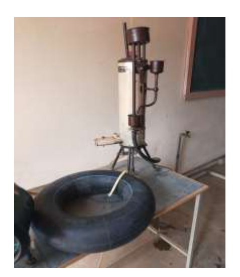
Fig.4 junkers gas calorimeter

Volume: 07 Issue: 03 | Mar 2020 www.irjet.net