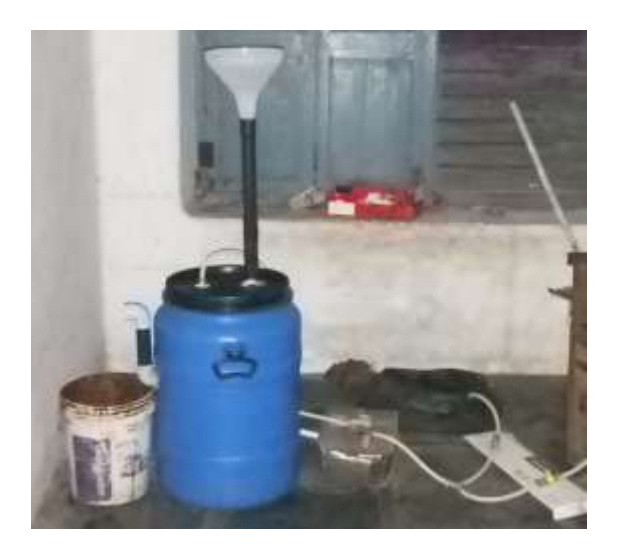
Fig.1 gas production plant

A biogas chamber of 20kgs slurry capacity was constructed and used for this experiment. The biogas digester was built to maintain the anaerobic condition. The inlet pipe is inserted into digester at \frac{3}{4} level. The outlet is placed at the \frac{1}{4} level from the top of digester as like as manometer head.