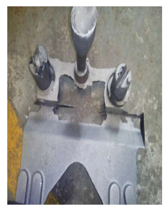
Fig -1 : support flywheel housing.

For installation plan we can utilize any sort material. In any case, it relies upon nature of work, work piece and so on. A few apparatuses are structured from wood material, a few installations are from metal, some are from plastic materials, and some are from composite materials and so on. As indicated by help fly wheel lodging part, it is chosen mellow steel material, for structuring of install.