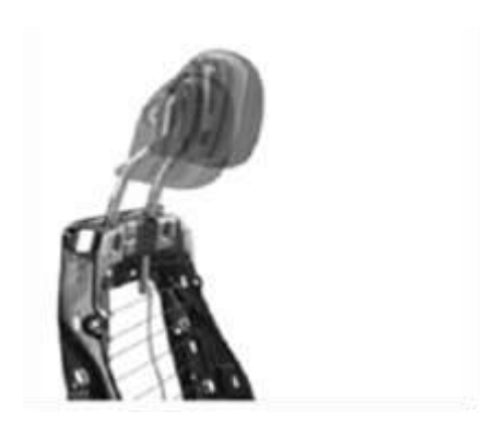
Fig.3 RHR [4]

The RHR system was introduced in 1997 as the world's first active, anti-whiplash head restraint and is standard equipment in all car models. It also provides multiple adjustment points to allow the head restraint to be ideally positioned for most front-seat occupants. Real-life crash statistics show that necks injuries are one of the most common results of rear-end collisions, even at relatively low speeds. The triggering factor in these whiplash injuries is the violent movement of the head in relation to the body during an impact from behind, often leaving victims with long-term pain in the event of a rear-end collision.