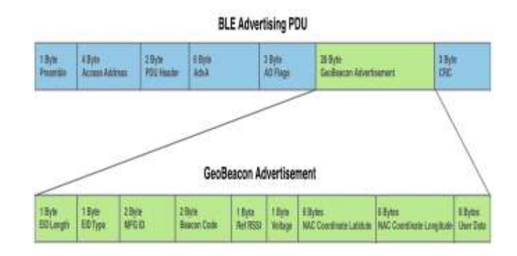
Fig. 4. GeoBeacon data strucute[11]

The GeoBeacon advertisement is made up of a 1-byte length field, 1-byte type field and two-byte company identifier, as prescribed by the Manufacturer Specific Advertising Data structure format, followed by 24 additional bytes containing the beacon advertisement data.[11]