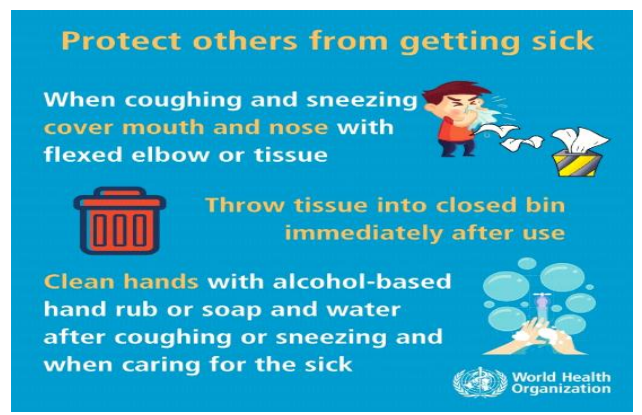
Fig -2: Protection of CORONA

On 24th March 2020,the Government of India under Prime Minister Narendra Modi ordered a nation wide lockdown for 21days, limiting movement of entire billion population of India as a preventive measure against the 2020 Covid-19 Pandemic India. On 7th April, reports said that the state government and other advisory committees recommend external lockdown on 9th April and 10th April, the state government of Odisha and punjab extended the lockdown in their States to 1st May Maharashtra, karnatka, west Bengal, Telangana followed suit. On 14th of April 2020, Prime Minister of India Narendra Modi extended the on going lockdown till 3rd of May 2020, with a conditional relaxation after 20 April for regions where spread have been contained or prevented [4].