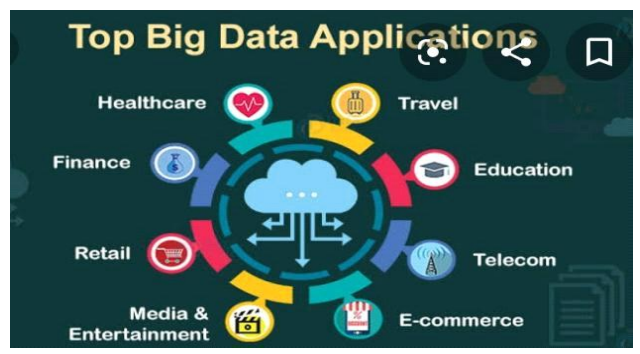
Fig -4: Applications

Condusting follow up visists: Using big data on speech recognition and semantics understanding technolog.