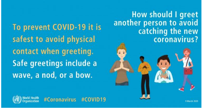
Fig -1: Prevention of COVID-19

The new corona virus is a respiratory virus which spreads primarily through droplets generated when an infected person coughs or sneezes, or through droplets of saliva or discharge from the nose. The outbreak was identified in Wuhan in China in December 2019 decleared to be a Public Health Emergency of international concern on 30 Janaury 2020 and reconized as a Pandemic by WHO on 11th of March 2020. As of 14 April2020, more then 1.92 million case of Covid-19 have been reported in 210 countries and territories [3].