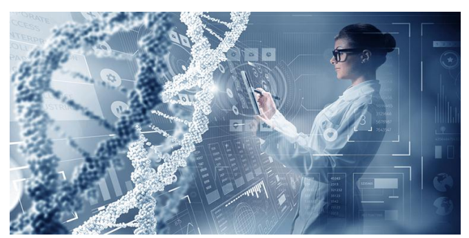
Fig -7: CT Image analysis-II

As we have collectively tested millions of people, some test results take more than a week. Testing of coronavirus remains among the most pressing problems with America's response to the pandemic. Patients suspected of COVID-19 are in urgent need of diagnosis and proper treatment