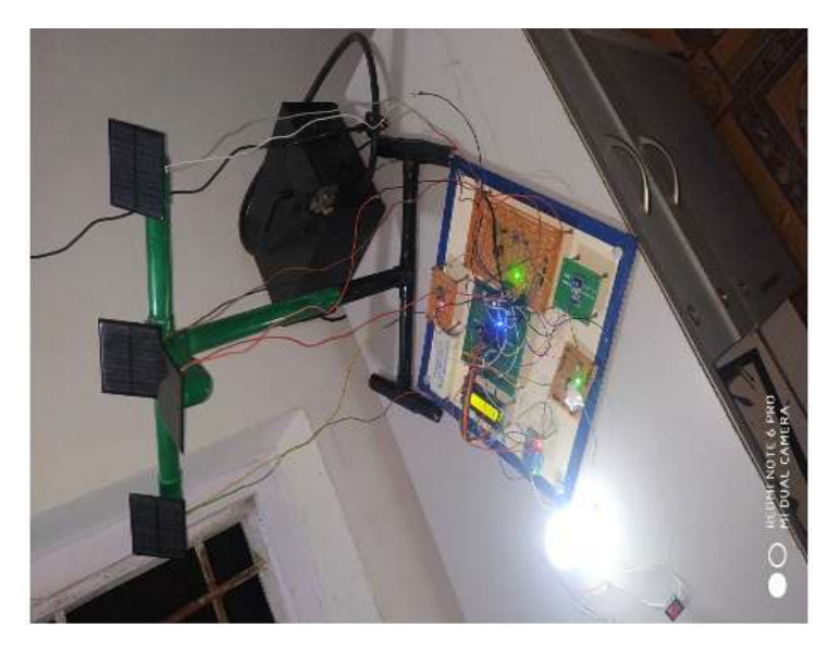
FIG 4.1 Snap Shot Of Project