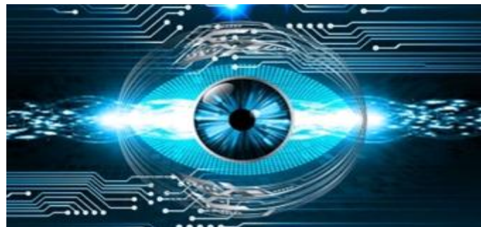
Fig.3: Computer Vision (CV)