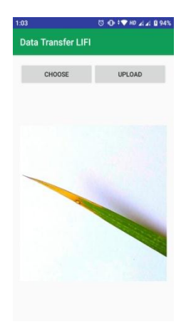
fig Android Application(UI)

The user will load the real time image(.jpg) into the python server through user interface. All necessary credentials will be taken from user and type of disease is updated to the user to respective Gmail account.