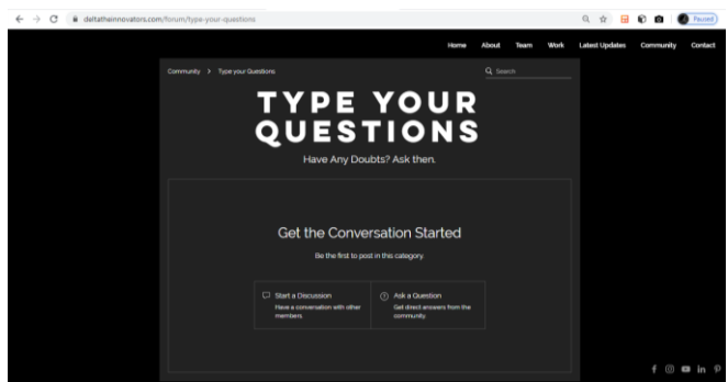
Fig 3.2.2: Web Application Interface