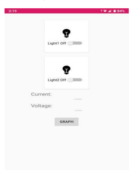
Figure 3: Android Application

The Mobile Application will communicate from the Microcontroller Unit through Wi-Fi. To prevent unauthorized access, it will first ask for credentials (login/password). Then as required by the user, it will send command for specific data and after that, it will display the data send by MCU (Microcontroller Unit) in a different form.