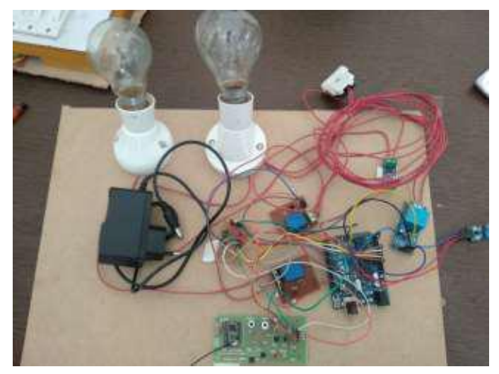
Figure 4: Implementation with 2 Bulbs

To display the data, there are various types of buttons, on each click a specific command will be sent so that MCU (Microcontroller Unit) will recognize that which data to be sent to user from Database. It also leverages the feature for turning ON and OFF the appliances according to user needs from Android Application.