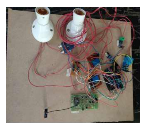
Figure 2: System Design

A wireless sensor has three technical components, an MCU (Microcontroller Unit), a sensing unit, and a wireless transceiver. The sensing unit is the most important part of a sensor. A hall effect-based sensor, ACS712, is used to measure AC in our system. We tested the sensors from a 100-Watt load to 1000-Watt load. In this testing, we assume the power factor is 1. A Relay is included for remote on/off control. The incoming data from each sensor contain the actual status of the device, the power consumption and a unique sensor ID. We store the received data in an SQLite database. The system receives several values per second from the sensors which are stored in the database for later use in a mobile application. When a user wants to switch on/off a device from a mobile application, the reaction time is below one second. As a prototype system, two services, monitoring and remote on/off control, are implemented in our system. Users can set the range of dates to check the energy consumption of a specific home appliance. Further works will include smart or intelligent services like statistical analysis, tariff comparison, and recommendation for usage, time-based on/off-control, etc.